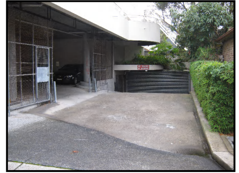
Existing rear vehicular entrance of subject site