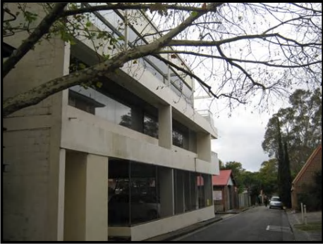
Rear of subject site.