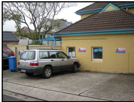
Child Care Centre accessed from Lindsay Lane, 95 Cabramatta Road.