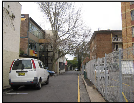
Lindsay Lane Streetscape looking east towards subject site.