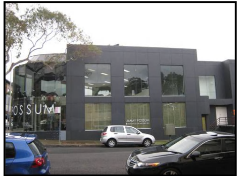
Neighbouring development to the west – 102 Glover Street