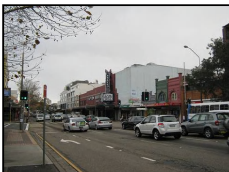
Development on Military Road north – west of the subject site