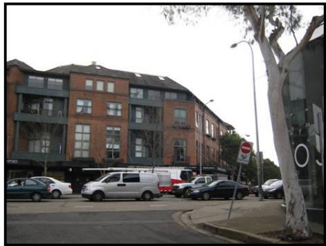
2 Macpherson Street