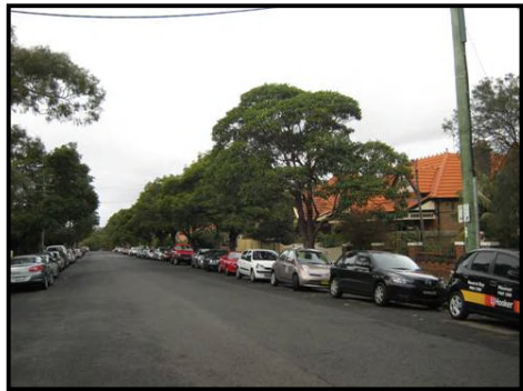
Streetscape southern side of Glover Street – east of subject site