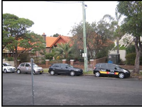
Neighbouring Development to the east – 96 Cabramatta Road