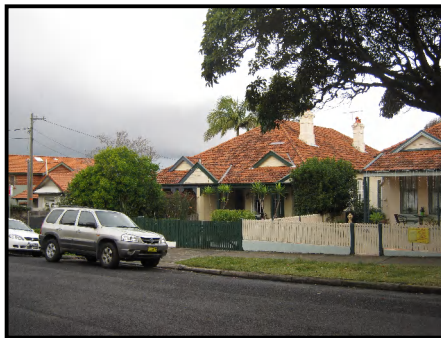
Typical residential development on the southern side of Glover Street, within the vicinity of the subject site