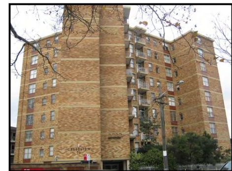
Residential Flat Building at 75 Spoforth Street, to the rear of the subject site