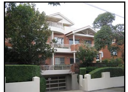
Typical multiple dwelling development on the northern side of Glover Street within the vicinity of the subject site