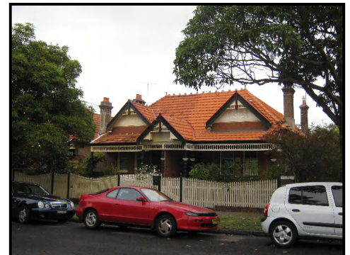
Heritage properties at 92 -94 Cabramatta Road