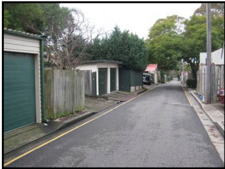
Lindsay Lane Streetscape, east of subject site