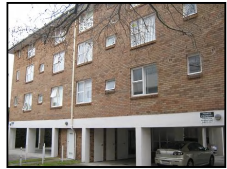
Development on Military Road above “Hotel Cremorne”