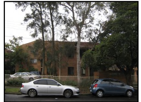
Typical multiple dwelling development on the northern side of Glover Street within the vicinity of the subject site