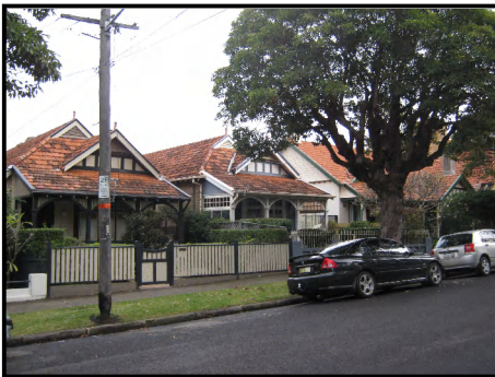
Typical residential development on the southern Glover Street within the vicinity of the subject site